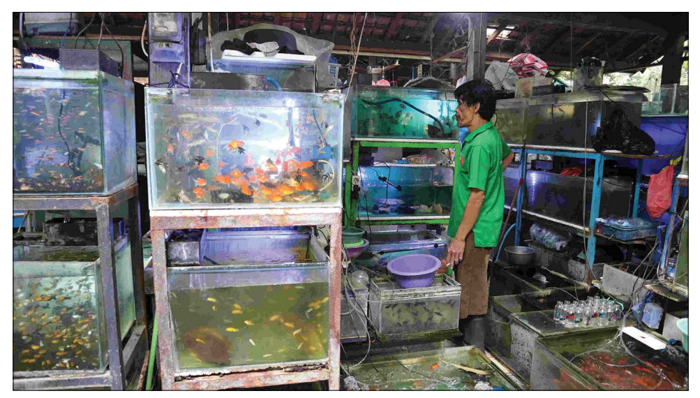
Figure-2: Wildlife market (fishes), Yogyakarta, Indonesia.

(United Kingdom and Germany); and Figure-10 Africa (Egypt).