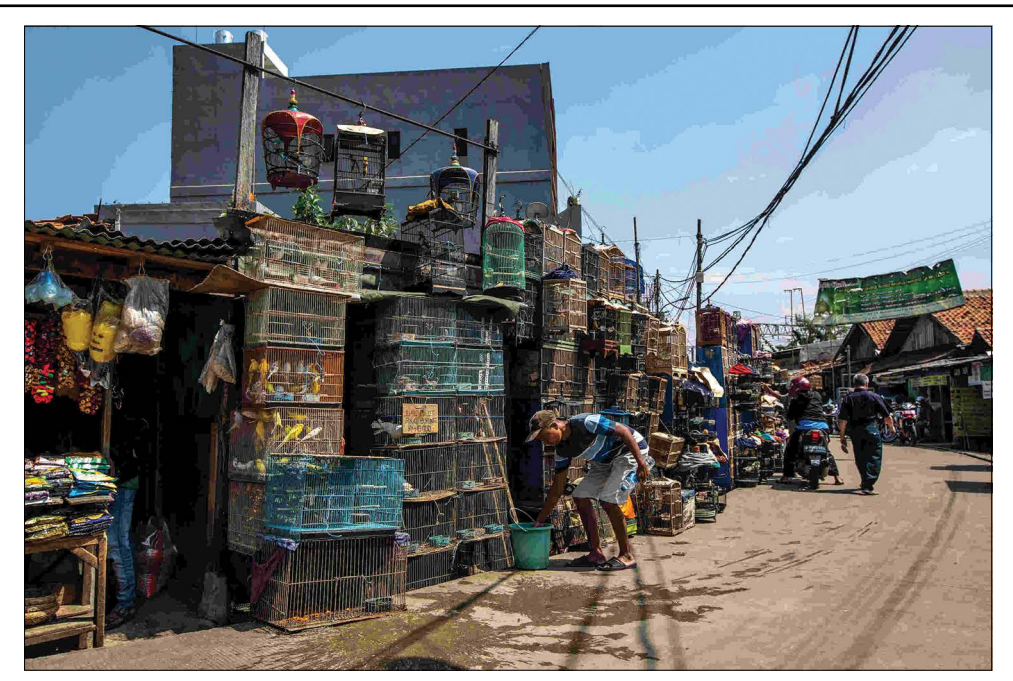
Figure-1: Wildlife market (birds and mammals), Jatinegara, Jakarta.