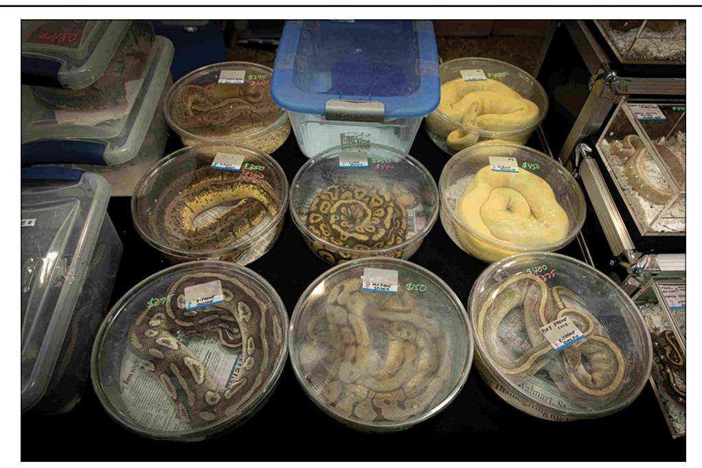
Figure-5: Wildlife market (reptiles), Memphis, USA.