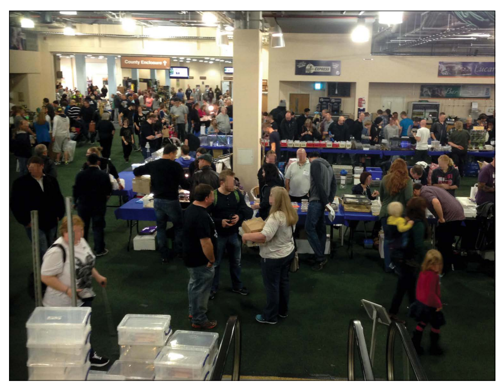
Figure-6: Wildlife/reptile market, Doncaster, UK.

In addition, at least 138 viral infections are associated with pet animals [50]. Many potential human pathogenic micro-organisms, particles and parasites are inherently normal and commensal among other animal species [44], and practicably non-eradicable [44]. For example, commensal Salmonella bacteria in prey mice are known to harmlessly invade snake guts to be excreted and become human pathogens through fecaloral transmission [143,144]. A survey of Salmonella at a wildlife-pet market in Germany found novel reptile-associated S. ramatgan and S. subspecies -V to be