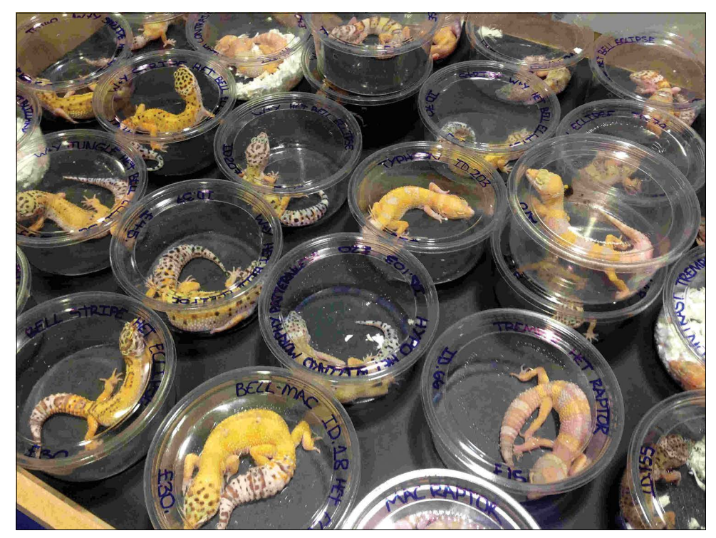
Figure-7: Wildlife/reptile market, Doncaster, UK. (Credit: Animal Protection Agency).