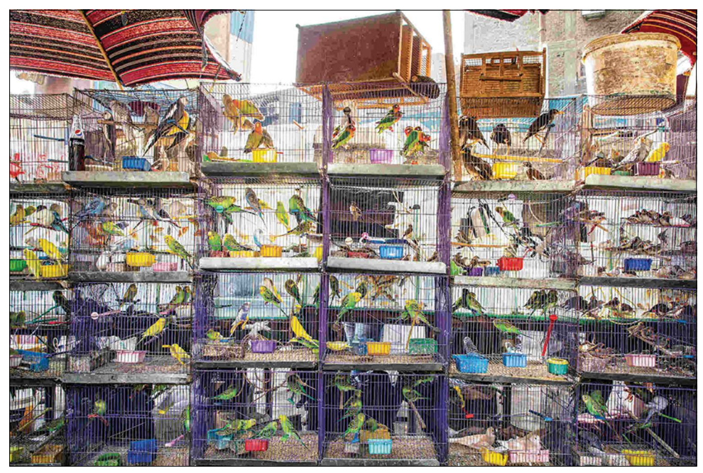
Figure-10: Wildlife market (birds), Cairo, Egypt.