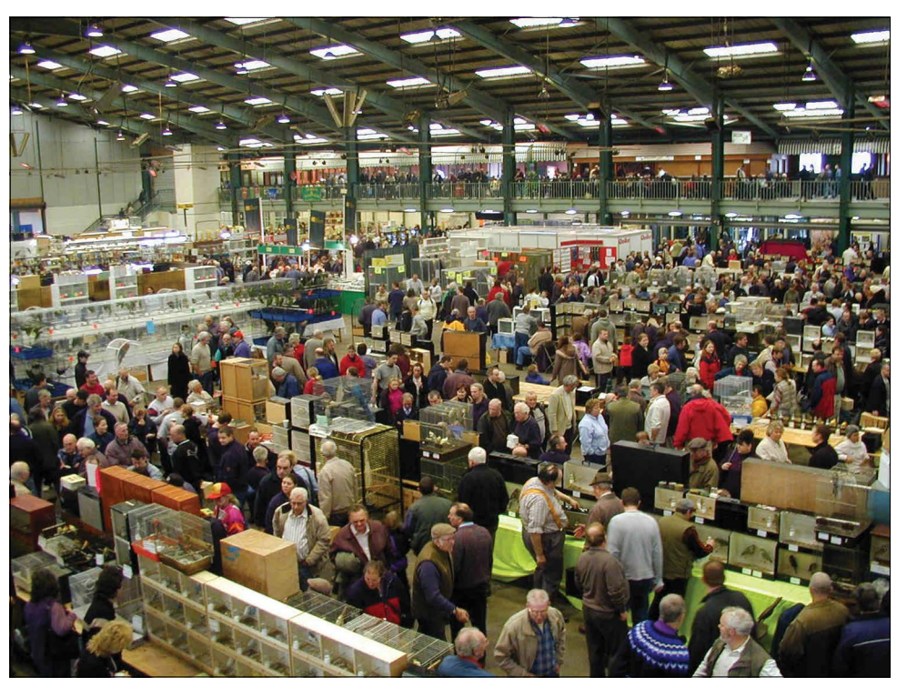
Figure-8: Wildlife market (birds), Stafford, UK. (Credit: Animal Protection Agency).

could transcend diverse hosts, for example, from invertebrates through to humans through the predator-prey food chain. Accordingly, microbial human pathogens and macroparasites may be presumed to occupy any animal from any world region or supply source, not least given the cross-contamination implications of wildlife markets and meta sectors (Figure-11).