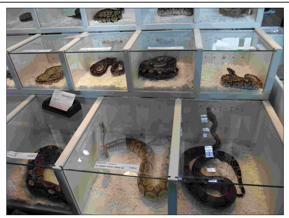
Figure-9: Wildlife market (reptiles/others), Hamm, Germany. (Credit: none).