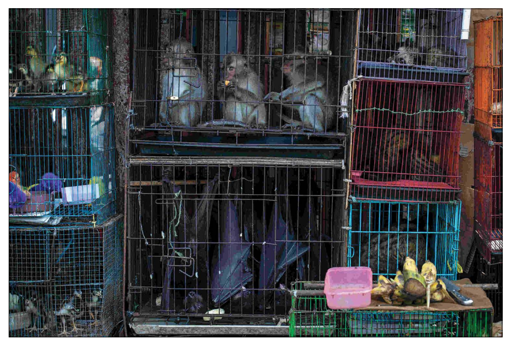
Figure-3: Wildlife market (birds and mammals), Jatinegara, Jakarta. (Credit: Aaron Gekoski, World Animal Protection).