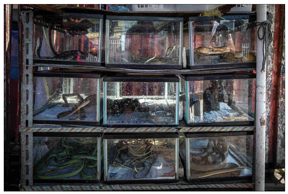
Figure-4: Wildlife market (reptiles), Jatinegara, Jakarta.

attendance and onset of signs and symptoms, and because health-care professionals frequently do not enquire about possible contact between patients and zoonotic sources [137].